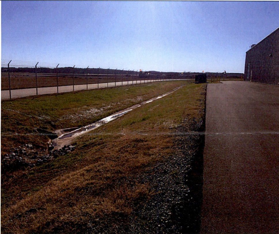
Stormwater Drainage ditch behind Cabinet Shop Expansion.