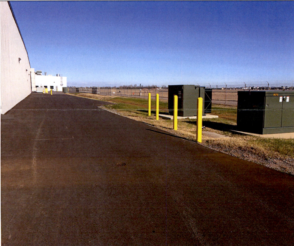
Back side of New Cabinet Shop showing new pavement and completed vegetation.