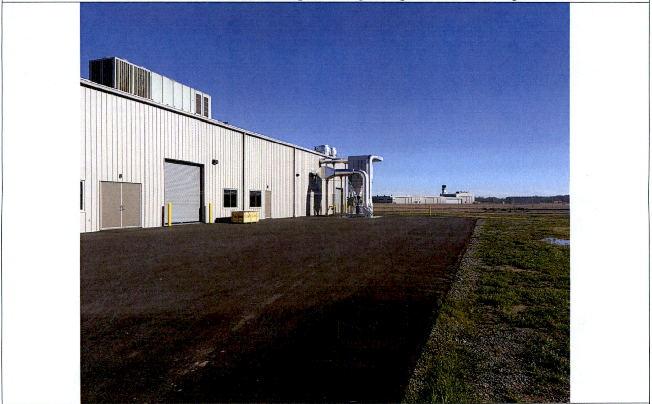
Side of the New Cabinet Shop showing new pavement and vegetation.