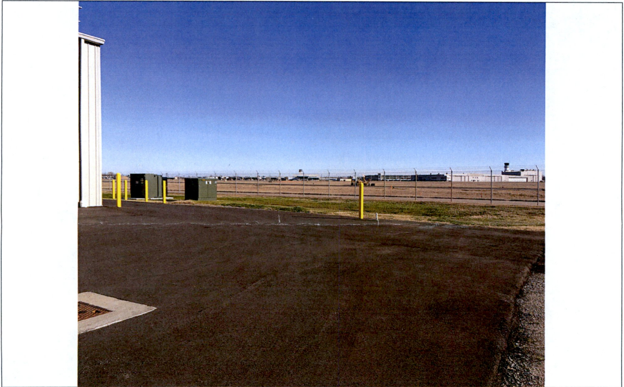
Back corner of New Cabinet Shop showing new pavement and vegetation.